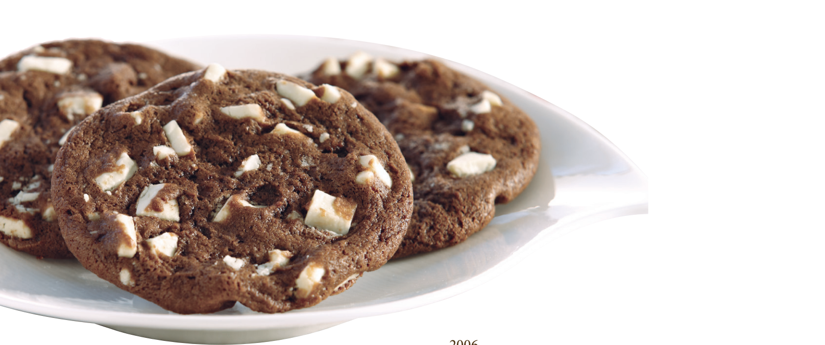
2026 WHITE CHOCOLATE MACADAMIA NUT $24

Galletas con chocolate blanco de nuez de macadamia MAC-A-DAMI-YUM! The subtle flavor of roasted macadamia nuts and melty white chocolate goodness. ☺