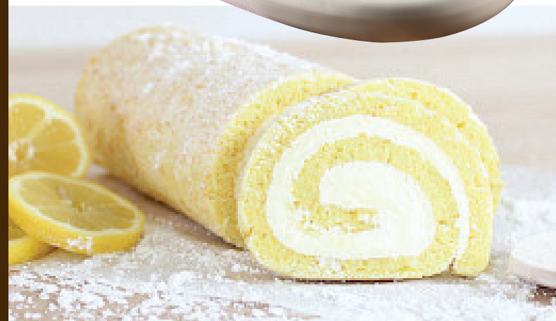
1011 LEMON ROLL $24

Tender chocolate cake filled with fluffy vanilla flavored crème filling and a dusting of powdered sugar. (15.5 oz. roll.)