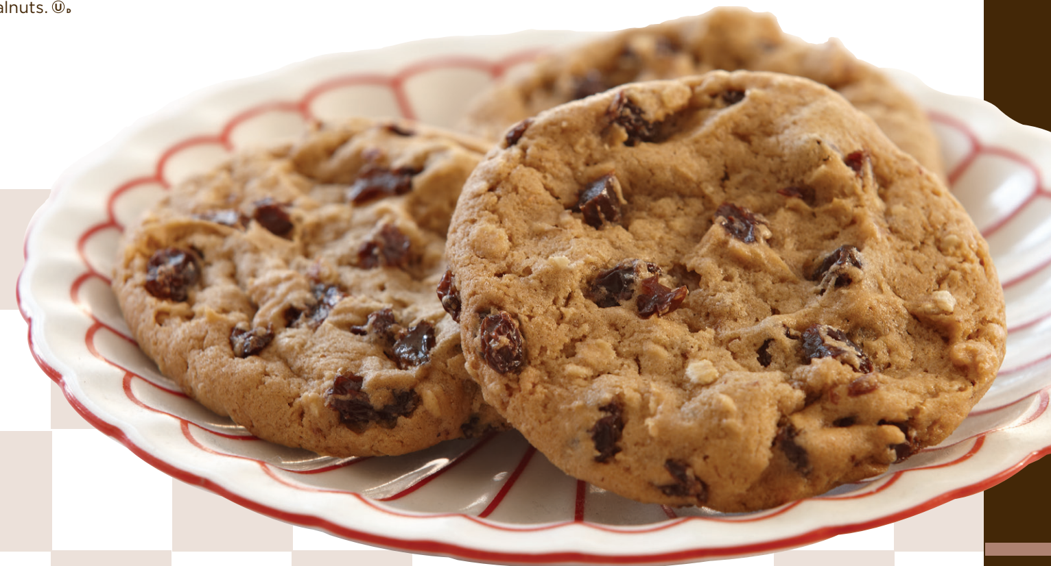
2007 OATMEAL RAISIN $22 Galletas de Avena con Pasas Plump raisins in an oatmeal brown sugar heaven. ©.