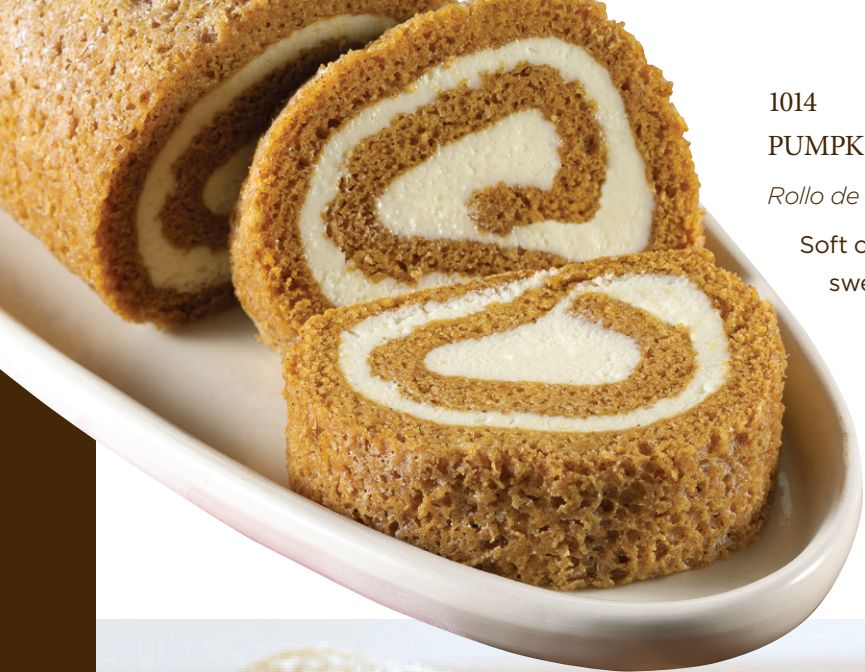
1014 PUMPKIN ROLL $22