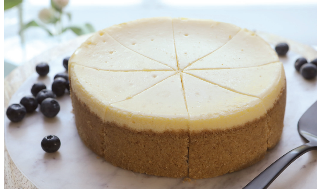
3080 THE CHEESECAKE FACTORY BAKERY ORIGINAL CHEESECAKE $35